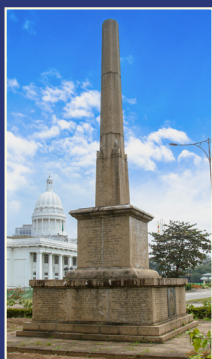
The Colombo Plan Monument in Colombo, Sri Lanka

The Colombo Plan for Cooperative Economic and Social Development in Asia and the Pacific was instituted in 1951 as a regional intergovernmental organisation consisting of 28 member countries. The Colombo Plan is operated on the partnership concept of self-help and mutual help, with overarching goal of enhancing human resource development and fostering south-south cooperation. Colombo Plan's areas of expertise include substance use disorder (SUD) prevention, treatment, and recovery, credentialing of professionalization of drug demand reduction workforce, gender empowerment and child protection. Currently, the Colombo Plan has five active programmes: Drug Advisory Programme, Maritime Advisory Programme - Capacity Building Ports Project, Gender Affairs Programme, Capacity Building Programme, and Programme for Environment and Climate Change.