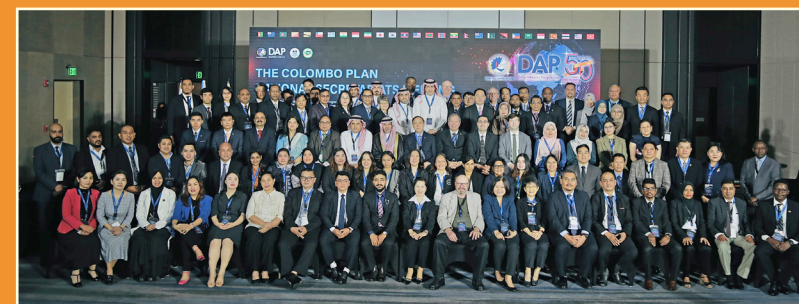
CPDAP National Secretariats Meeting 2023, Manila, Philippines

CPDAP's Universal Recovery Curriculum (URC) equips participants with core competencies and skills to work as recovery support professionals. The URC curricula consists of two stand-alone courses: the Recovery Allies (Allies Link and Lend Inventive Engaging Support) Model and the PEER (Peer Experiences Empower Recovery) Model.